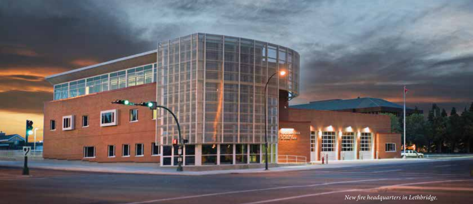
New fire headquarters in Lethbridge.