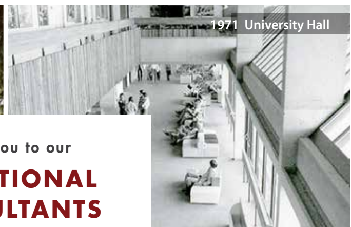
1971 University Hall

Thank you to our EXCEPTIONAL CONSULTANTS