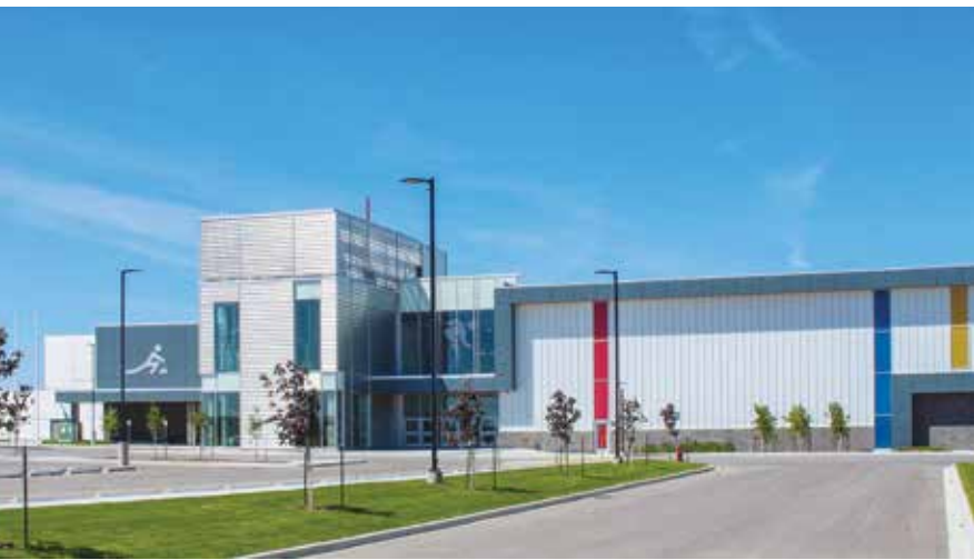
ATB Centre in Lethbridge.