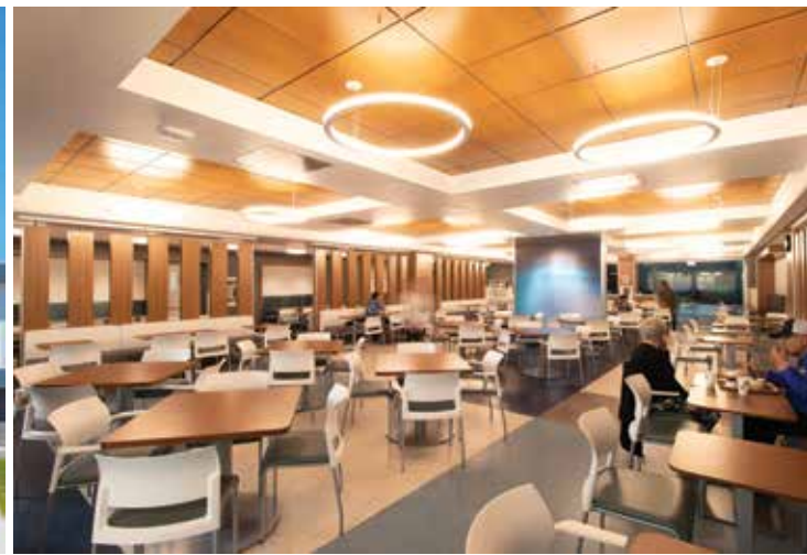
Chinook Regional Hospital cafeteria upgrade.

offices, Cocks is also involved in numerous projects for the City of Medicine Hat, including the airport terminal renovation and expansion completed in 2015. A newly modernized passenger screening and holding area, a new arrivals hall and a new concourse improve the circulation of the terminal and allow natural light and warmth to fill the space.